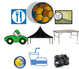
Fig 3: Composition Pattern

A successful picnic is a composition of several elements including food, sport events and games from which attendees can have emotion and social interactions. The purpose of hosting a picnic is getting people together and making them have a good time. The tents and carpool are also prepared so the guests don't have to worry about the weather. Organizing a picnic is equivalent to design a system and the needs of customers should be always taken into consideration in the first place and those needs are used to generate the blueprint of the system.